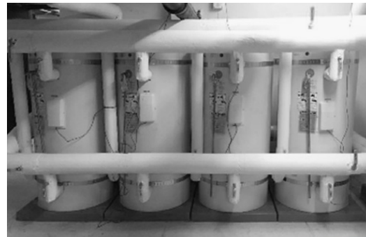
Indoor hot water storage tanks.

2) Indoor Installation: Heat pumps cool the surrounding air and can create cold interior spaces. If a space in the building requires year-round cooling, AWHPs can provide efficient cooling as a byproduct of DHW production. However, if the space requires heating in winter, the heat pumps will significantly add to the heating load.