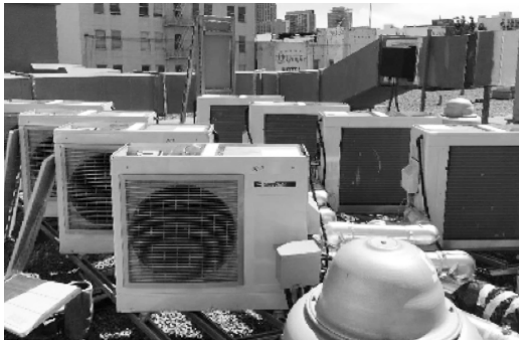
Rooftop air to water heat pumps.