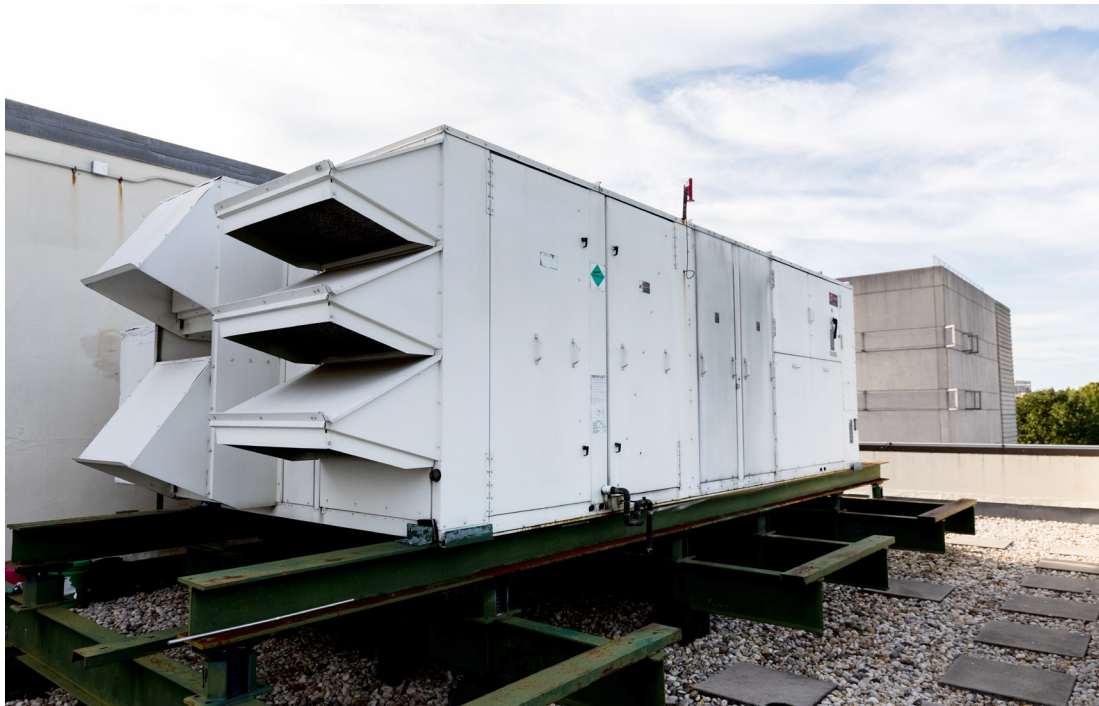
New York Botanical Garden

*ratings are based on system end use, see back cover for details.